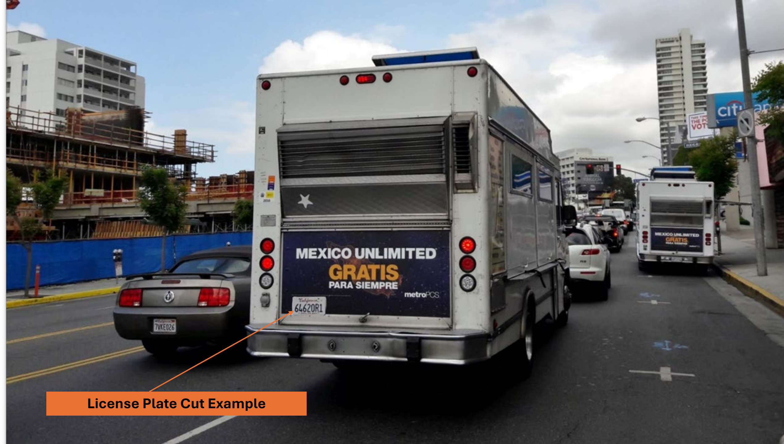
License Plate Cut Example