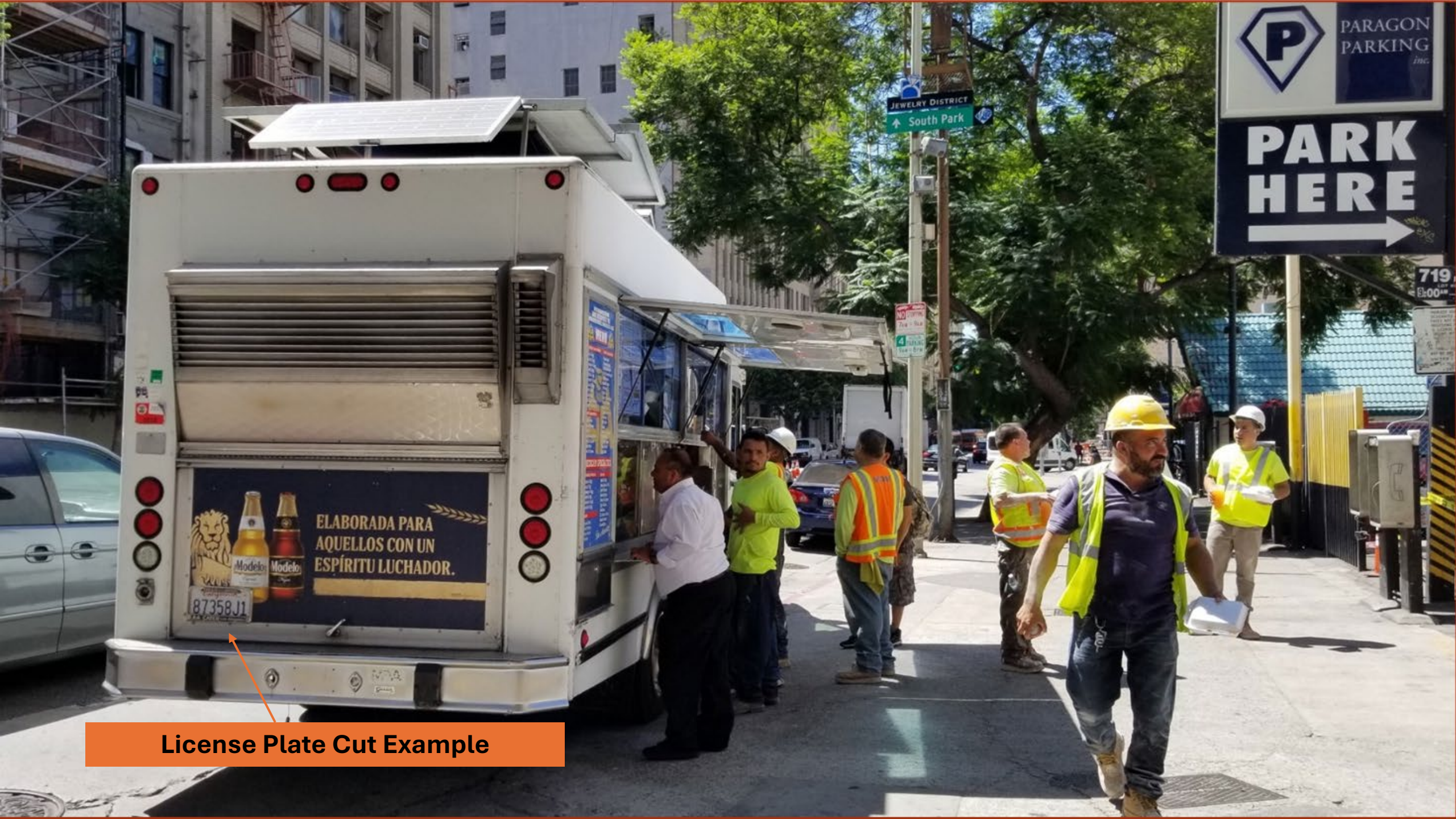
License Plate Cut Example