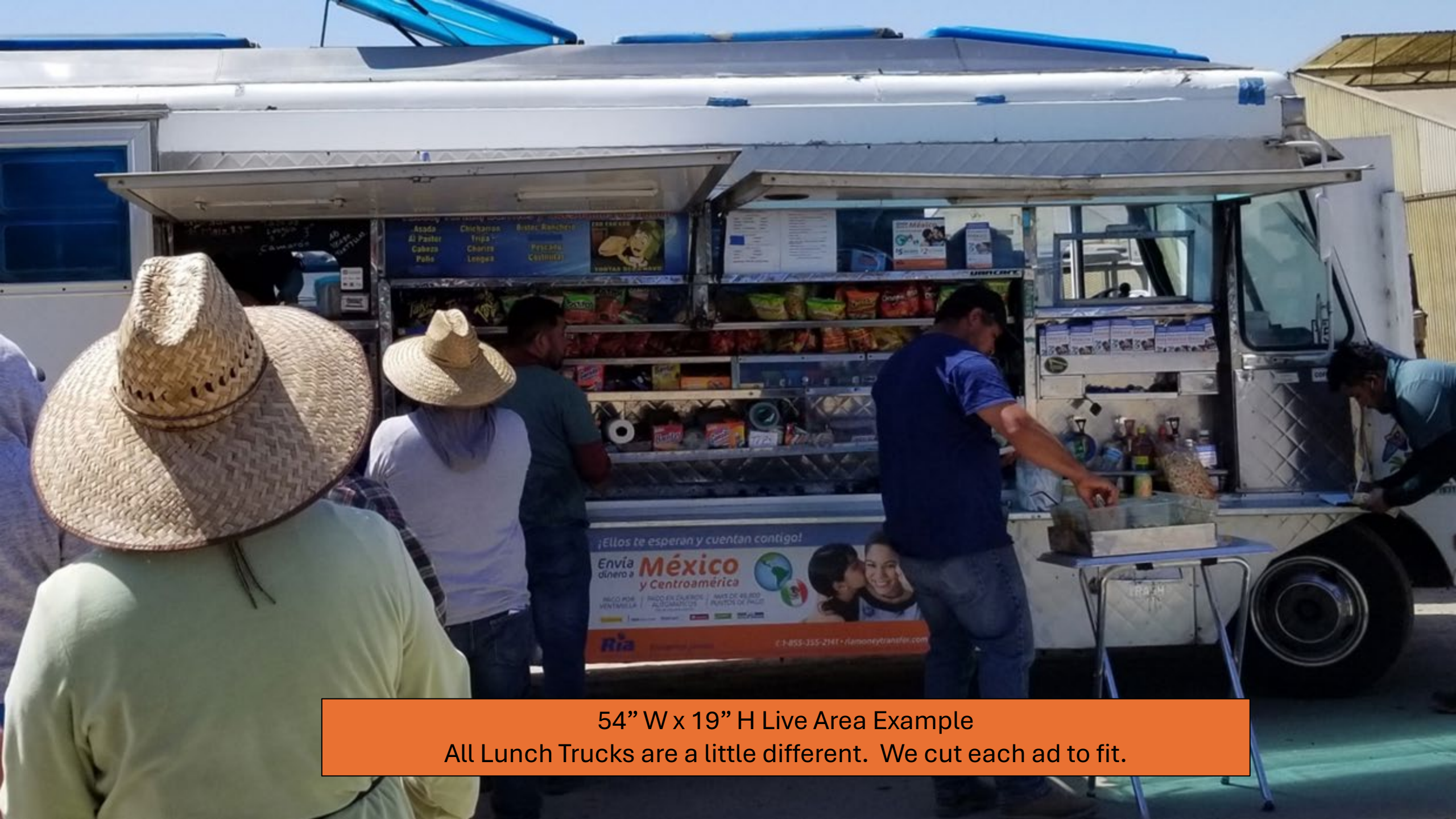
54" W x 19" H Live Area Example All Lunch Trucks are a little different. We cut each ad to fit.